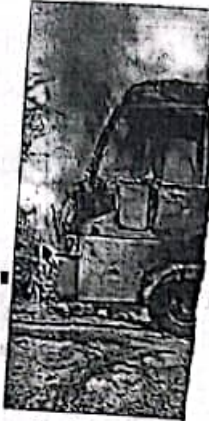
Smoke billows after fire, killing five people, including Chief minister Yashraj Singh of the deceased, at the Punjab and Haryana government quarters in Chandigarh.